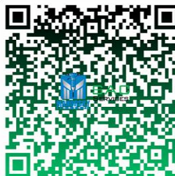
SAC Intro Video

Corporate Office 4803 Rayford Street Jacksonville, FL 32254 888-340-1875